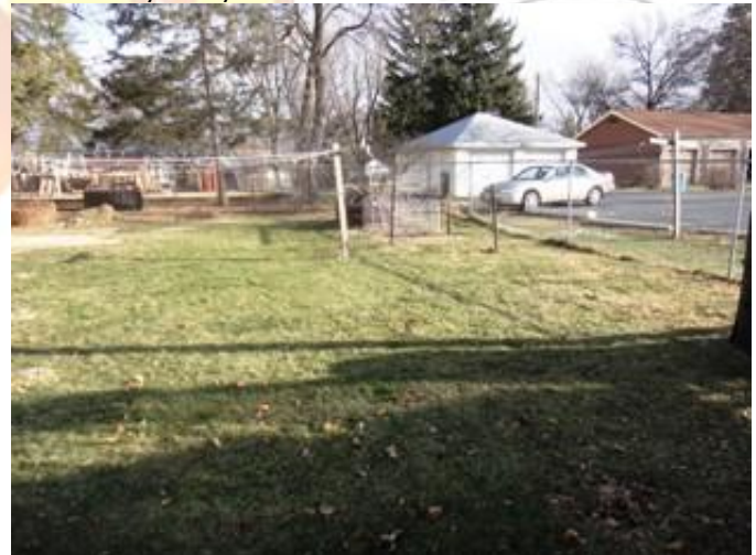
This is the first green grass of 2011. It looks nice even if it was only 20° around noon and New Year's Day.

Yesterday when I was outside and the sun was very bright I noticed how green the grass was. I thought I would share it with you. Seeing his made me feel warmer and maybe you too.