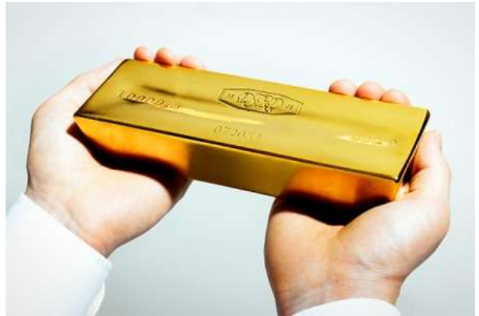
This would be cool to have. Well if it was mine!