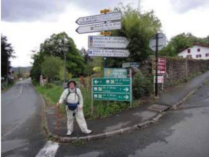
May 4th: Starting to Walk my Walk.

I went to my left which I think was west. You may notice it looks to be up hill. It was something like 1,500 meters. Oh that is about 5000 feet. It was the toughest day I walked