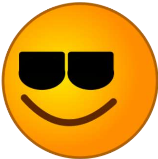
And Mister Cool.