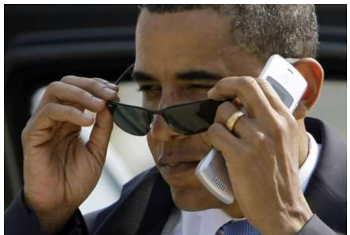
Equal rights to the not so cool

Well I hope this helps even it doesn't make you cool. The one picture makes my put a couple bottles of my wine in the fridge. I remembered the Strawberry Mist