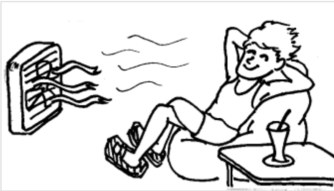
One more cooling pictures:

wine was very good when chilled. Yammers! ☺