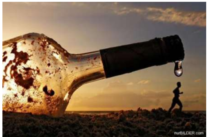
This is just a cool Picture!