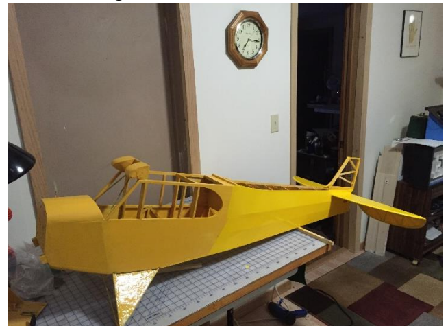
At 7:18 it looks like this.

I will still have to get into the front to installed the batteries and controller for the motor. I decided to go with an electric motor instead