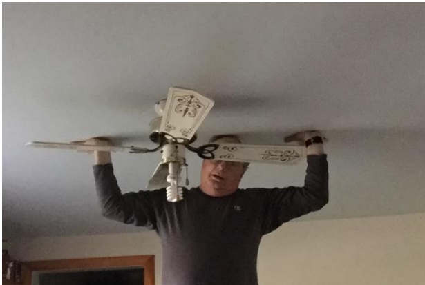
Need I say more?