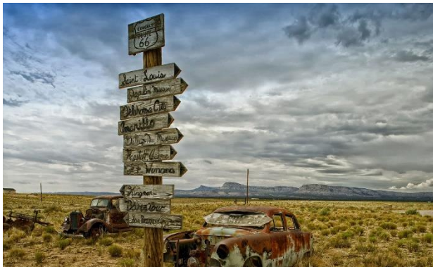
Maybe I should look for this sign on my road trip?