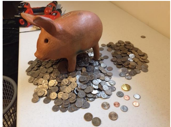
After all the coins leaked out.

At first, I was seeing only Quarters. After a while I found a few other coins. I found four Dollars, three Pennies, and three Nickels, then I came across a Chocolate coin. The rest was Quarters.