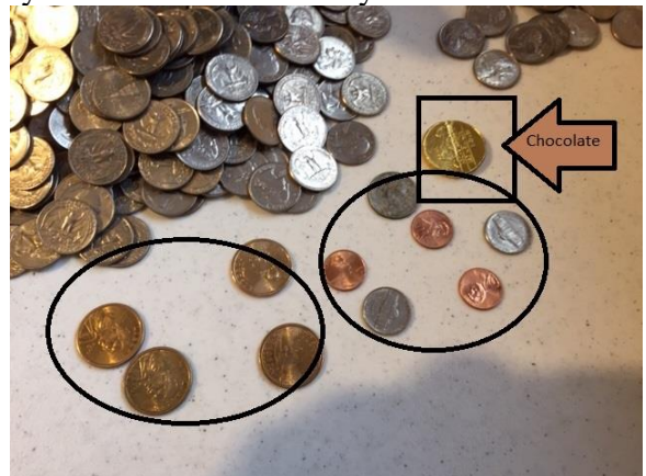
The rest is Quarters

After that I divided the Quarters into two piles. One with the Washington Quarters the other with the State Quarters. Then I started counting. That story will follow another day.