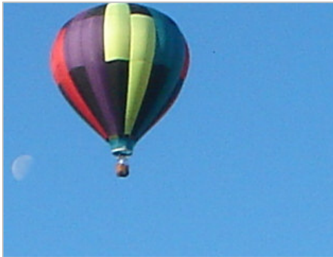
Before I left I was treated to a balloon show.