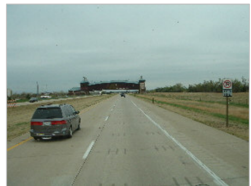
There is still a lot of road to travel and you can't park here.

I decided after that long rest from not driving I would have no problem getting home with getting sleepy. If I did I would just stop somewhere and rest. After getting to Illinois I had to stop for fuel. That