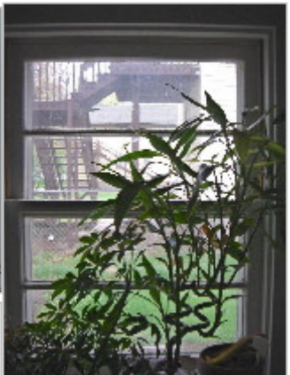
The plants in my only south window where I have plants grew and need water.

I have this grass and lawn mower to work on too. Vacation are also about returning home and doing things you might not want to do too. I need to clean out the motorhome and pay bills and get ready for the next adventure.