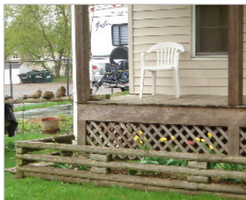
Tulips awaited me on my return home

I returned from vacation at 1:20am this morning. I will be updating the vacation notes in the next few days. But for now I have to go eat breakfast.