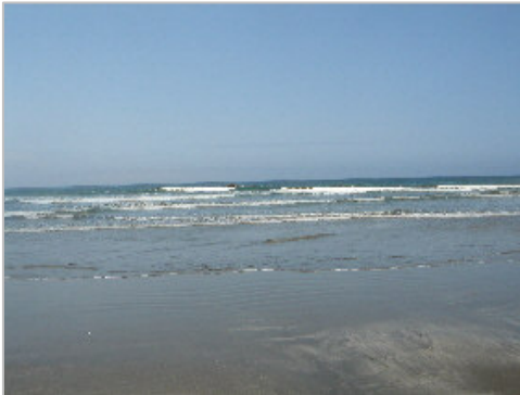
I took many pictures of the Ocean