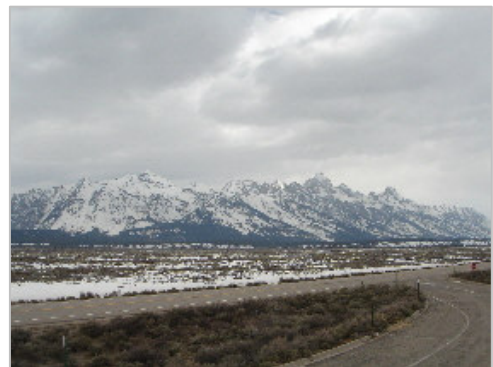
I parked at one of the many pullover on the road to Yellowstone to take a picture of the snow that covered Teton