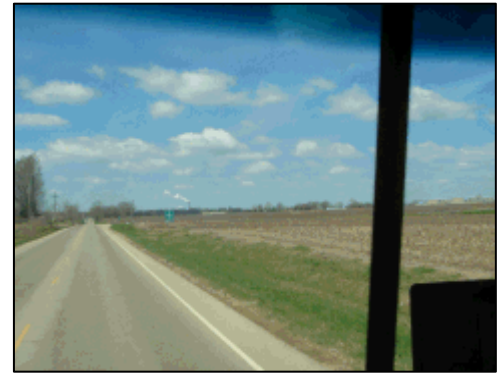
This is did not mean I was near where I was going yet.