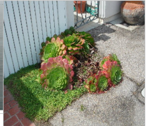
Hen & Chickens in someone's garden