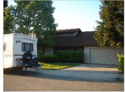
My last view on Mike & Petra's before I headed down the road.

I was glad I was coming out of the mountains because I was tired! I stated looking for a place to park for the night. I left the interstate and saw a truck parked in a big opened gravel area just off the road. I pulled in behind him and parked. It thought would be more trucks before long.