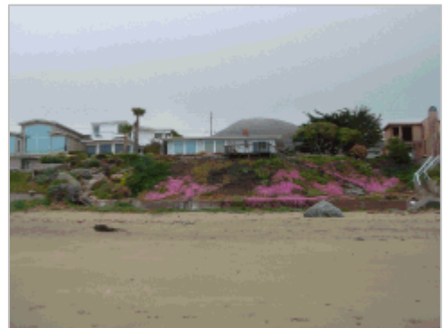
This is a beach house with lots of flowers.

After diner we went somewhere else and walked around town and looked at the town.