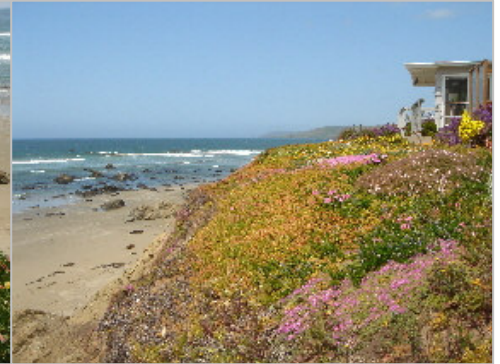
Yes, even more flowers. There were flowers everywhere.