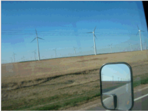
I saw a lot of wind generators along the way.

I don't see any notes for the 15 th . I just see that I had cranked out 1312 miles for the trip and burnt 164 gallons of gasoline and averaged 7.4 MPG. This is not very good for the gas mileage!