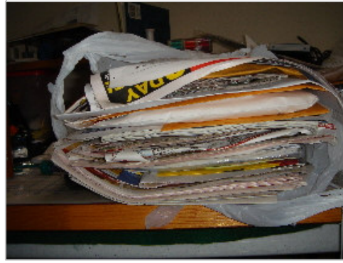
And there was the 12 pounds of mail that I had to go through.