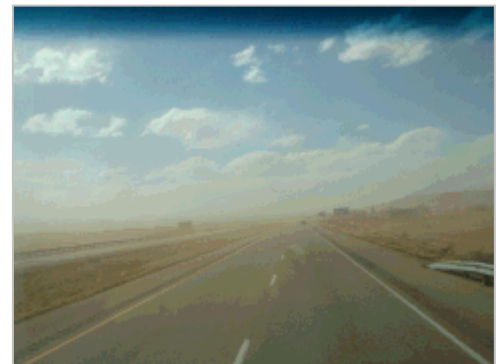
Today I found a lot of dust blowing around.

They were out of regular syrup for the pancakes and it bothered the waitress to tell people. I had the pancakes with cherry syrup. Different! ☺