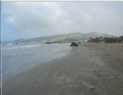
We are about half way on our walk. See The pier in the back ground?