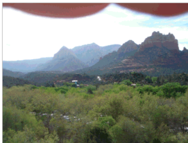
You can see the RV Park in the foreground and the Creative Life Center about mid picture. This is looking the other way from the picture yesterday. (and my finger covering the lenz on top.)

In the evening I rested watching the movie "The Long, Long Trailer" then turned in for the night.