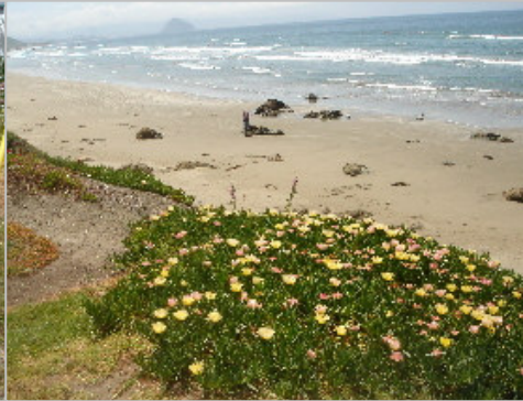
Flowers in front, Petra stretching in the middle and the ocean in the background