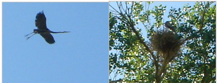
This is the Great Blue Heron and one of the nest in the tree. They had about a six foot wing span!

Note: I just got an email from Linda at Rancho Sedona RV Park. The birds were Blue Herons.