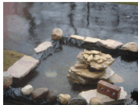
It was raining but I need to get ready for my vacation anyway.