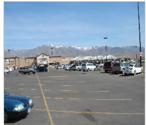
Even in the desert at Wal-Mart there was snow in the mountains

My plan was to stay on I-80 to US-93 and then go north to Twin Falls, Idaho. There find a place to stay for the night.