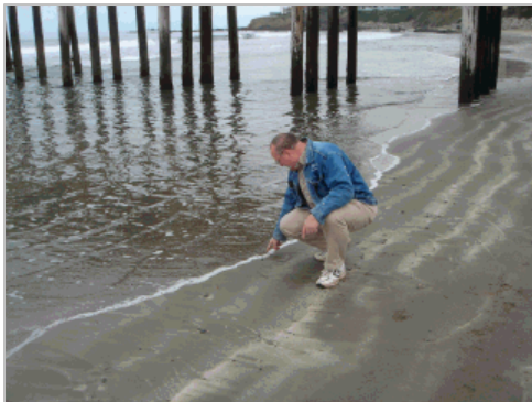
I got to touch the Pacific Ocean for the first time.