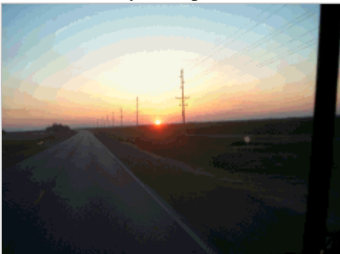
The sun was setting and trying to tell me it was time to rest.

that tank of old gas or it could be the wind and rain on the first day. Today's fill up told me 9.6 MPG. That is a long way from the 40 MPG I get with my car, but is more than the 8.0 I expected. By the end of the day I had driven 937 miles since I started on April 12 th . I think I camped is a rest area along the highway some where. I did not note it.