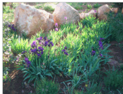
While walking around I saw these nice flowers.

After the seminar I went back to the motor home and cooked some food and watched a movie.