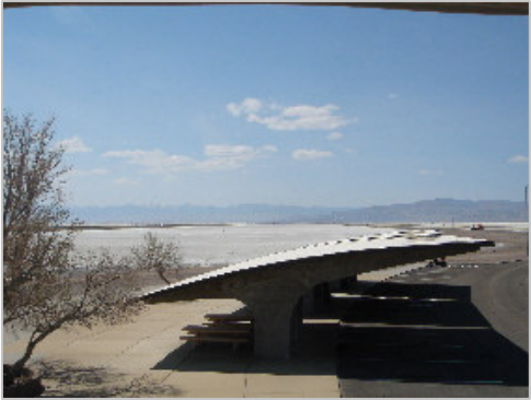
At this rest area I took a picture because it was a neat rook over the picnic benches and you could see the salt from the Great Salt Lake.

For the night I had stayed at The Mountain Shadows RV Park in Wells NV. I thought I should check the tire pressure before I hit the road. They were just fine. And left in the morning and it showed it was 8 hours to Yellowstone.