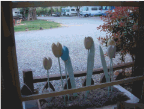
This is a picture out of the laundry room at the RV Park and the wooden tulips.

I did my laundry in the morning, washed the bird poo off the motor home, emptied the waste tanks and filled up with fresh water.