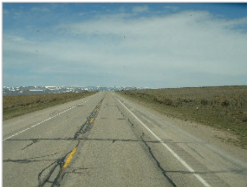
This is one of the better roads on the way to the Teton Mountains.

I started north in the direction of Yellowstone. I