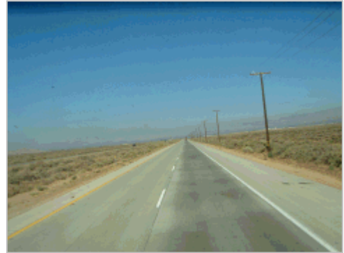
There was a lot of road to travel in the desert.