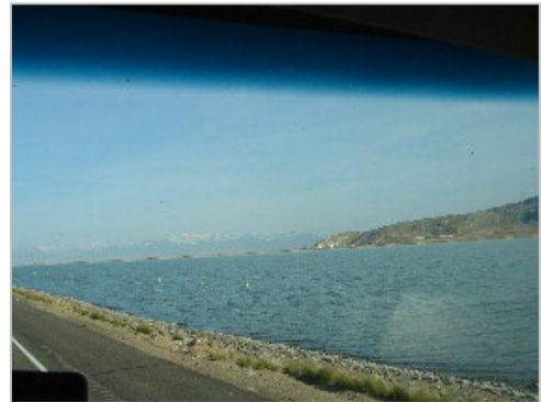
I did get to see the Great Salt Lake as I entered Salt Lake City before the traffic

The ranger asked; "Where are you heading?" I told