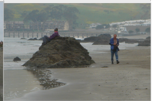
I zoomed in and retook the picture. Does this help see the pier?

Note that this pier is was I was standing when I touched the Ocean.