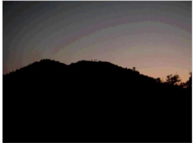
Those 3 of 4 sticks on the other hill in the middle of the picture are people standing. It is neat how this picture came out.

It was later when I got back to the RV so I made some tea and turned in for the night.