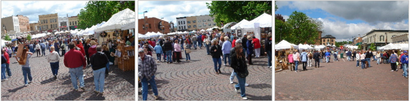
It was jacket weather but sunny and many people were on the square.

I took a little time after breakfast to check out the Fair Diddley® on the square. There were a lot of talented people displaying there wares. And there were a lot of people checking them out.