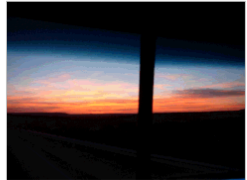
And still another sunset in the west.