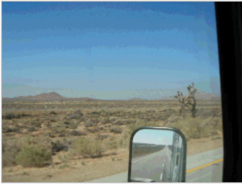
There is a lot of desert out this way

I awoke to a 52° temperature inside. I forgot to turn up the heat last night. I guess it was a dry cold because I wasn't cold. ☺