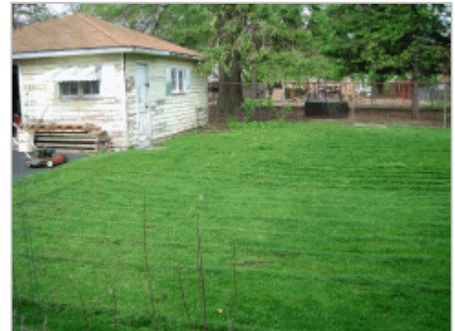
See, the lawn is cut. I need to put paint or siding on the garage too.

So now that I am dried off and the mower has cooled down I will go back to working on the file server.