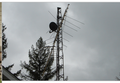
The antenna is getting ready to find the ground. I need to take care of this.