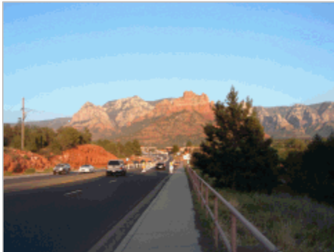
Even in a scenic area like Sedona there are construction zones

Sunday after noon I decided to head to Airport Mesa to sit on the mountain. I came to Sedona to sit on the mountain and do nothing for a while. It was nearly a three mile up hill hike all through the construction zone and up a back road while it was getting dark. I could do that! The sun set while I on the way. I was able to write some notes before it got too dark. I decided to hike out the back way in the dark. This