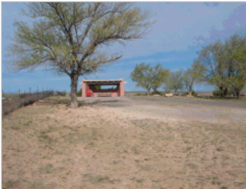
I woke up in this nice Rest Area that had many RV in it last night.

I arrived at Clines Corners, NM. I think every time I go to Arizona via I-40 I stop at the Clines Corners. It is a truck stop, souvenir shop, and restaurant. I think that was all there was to Clines Corners, NM. The people are friendly and the food is good. Many years ago I met the Psychic Cowboy here. His day job was that of a trucker. You always meet some interesting people in small town places.