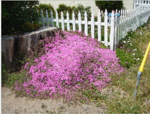
Some more flowers