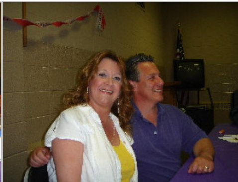
They look a lot better after they are deflated.