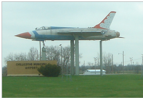
I saw this jet Parked on these polls in front of the an airport

closed on Sunday. So I thought I would drive down the street to the restaurant where I ate 3 years ago. That was another dead end. It looked like it had been closed for a year. I guess things change. Being it was only 7:30 I did not want to hang around town to just say "Hi!" to one person.