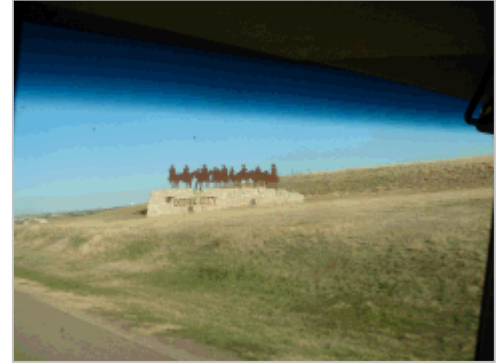
I went right on by Dodge City

Nothing but driving today, I am trying to get to Sedona, AZ some time Thursday.