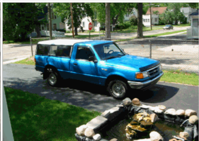
New thing in my driveway