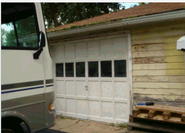
That is a little better