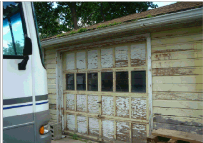
It does need some paint