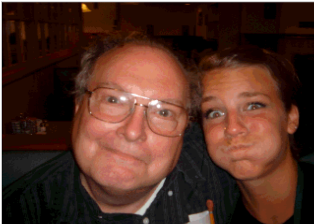
Sometimes we aren't smiling