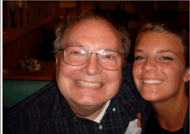
We can both smile