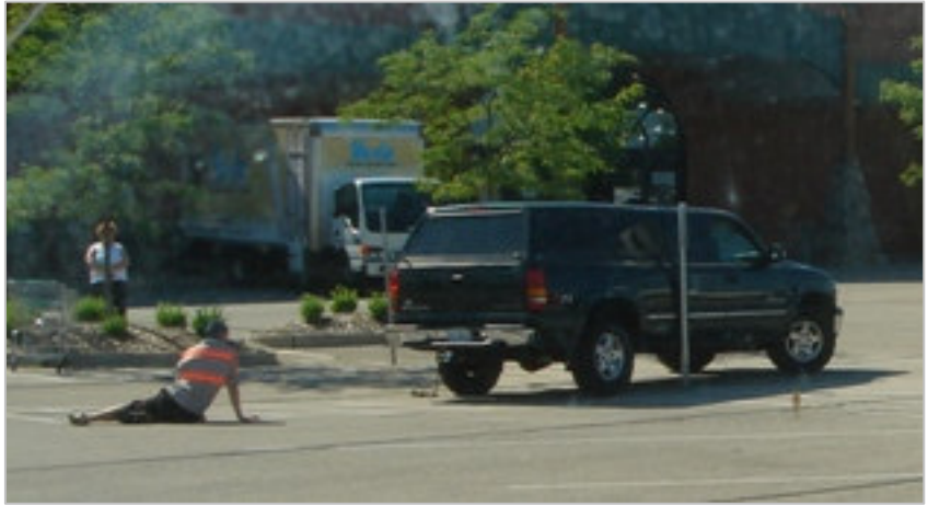
Not a Post-it-Note but a Post-a-SUV

This is funny. This is not a person hit by a car. This SUV was jammed tight up against that sign post or it had to have grown there. It had to be slid sideways to be there because there were no scratches on the side of the SUV. There is a tow truck just out of the picture trying to pull it off the post. The person on the ground was looking under the SUV to make sure they didn't bend anything. This was at Menard's