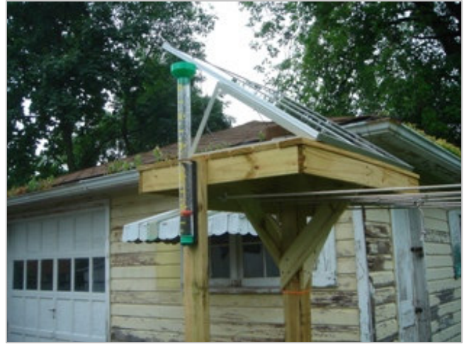
Solar Panel, Clothesline, and the Rain Gauge's first rain

It shows 1-1/8 inch of rain. My fancy electronic gauge on my weather station shows only 0.57 inches. I wonder which is correct. Maybe this new one got wet a few days ago when it rained. Hummm! It's empty now. I'll have to check it the next time we get rain. This one is marked with 1/4" marks. The electronic one measures in 0.01" increments. This means I could read the gauge wrong but not three-fourth of an inch. So I hope it rains some more so I can check again.