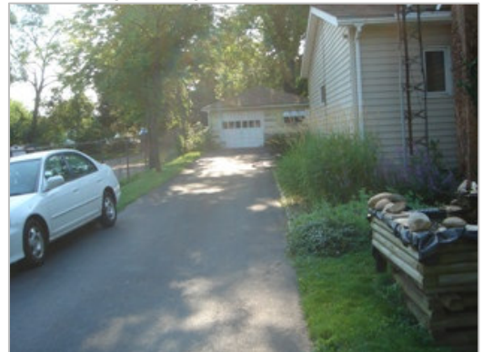
Boy does the driveway look long when empty

The RV & pickup are back in the drive way so you can almost not see the garage from the street.