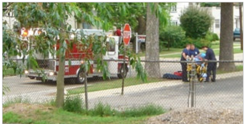
Rescue Team hard at work

When I returned from diner yesterday, the rescue squad was just past my driveway helping someone lying on the sidewalk. I don't know what happened. I over heard part of what was being said and it sound like the person was not sure what happened. I saw that it was a full size person, a Man I