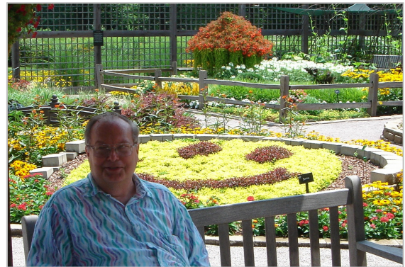
Me sitting in front of a smiley face