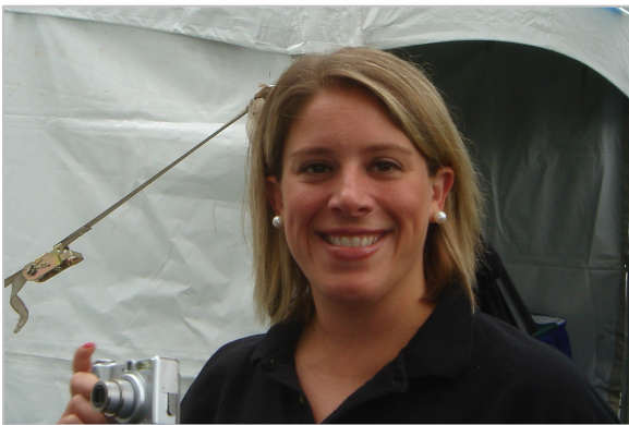
I didn't get her name. I just thought she had a nice smile