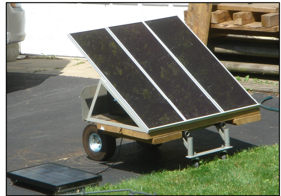
22 watt panel on the left and three 15 watt on the cart

I also have three solar panels configured to 45 watts along with a regulator for charging a battery. All total I can produce about 67 watts an hour. In May in this area of the country they claim I should get 6 to 7 hours of sun light a day. This means I should be able to get 0.067 kilowatt hours (KWH) for each hour the sun shines on the solar panels. That comes out to about 12 KWH a per month. That is a long ways from the 1207 kWh I used last month. I need 100 times as much and/or conversion more power.