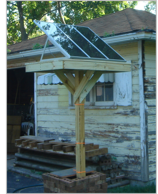
Solar Pole w/o Clothesline and w/o Sun