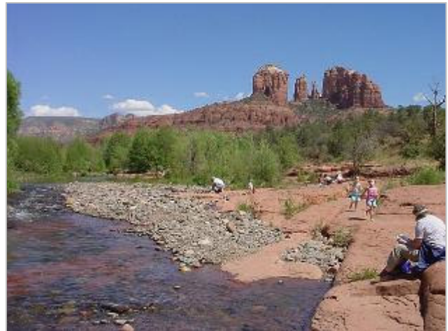
Oak Creek at Cathedral Rock Sedona, AZ 10/2003