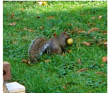
He is getting ready for winter.