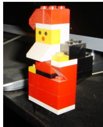
Santa started watching me in November.