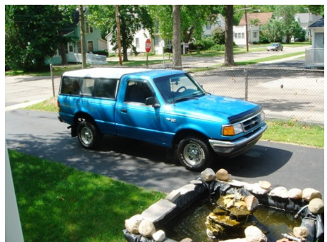
Guys need a pickup so in June I got one.