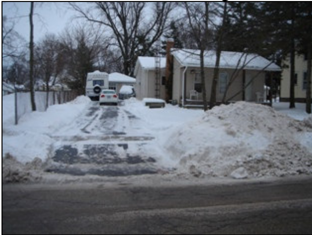
Snow in the Driveway 12/26/08 at 8:00am