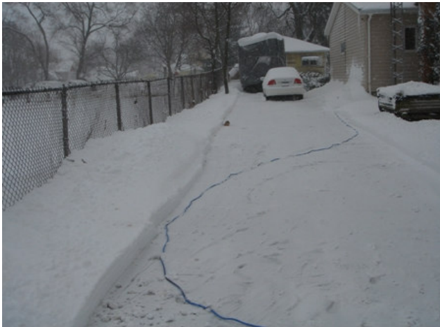
We had a lot of snow in February