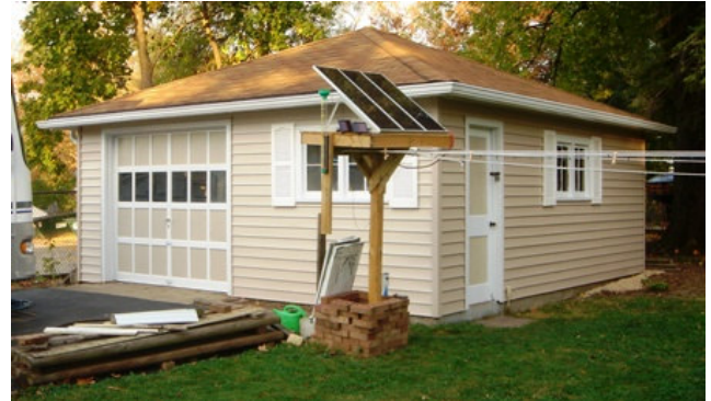
It looks better with new siding in October.