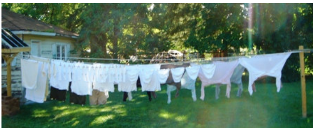
I really did use the clothesline in August.