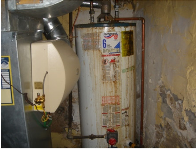
Water heater failed in January