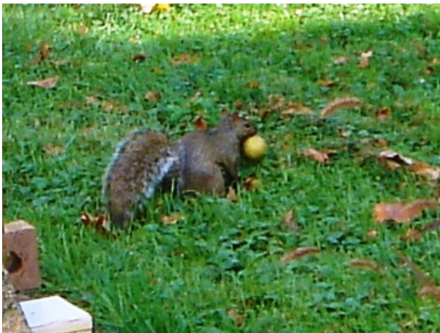
Squirrels were storing nuts in September.