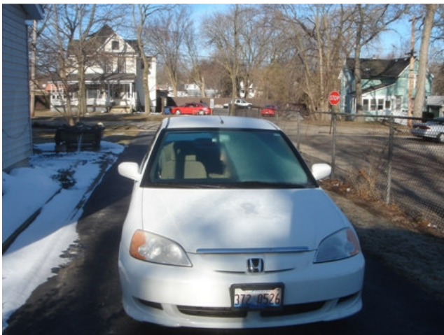
Most of the snow was gone in March