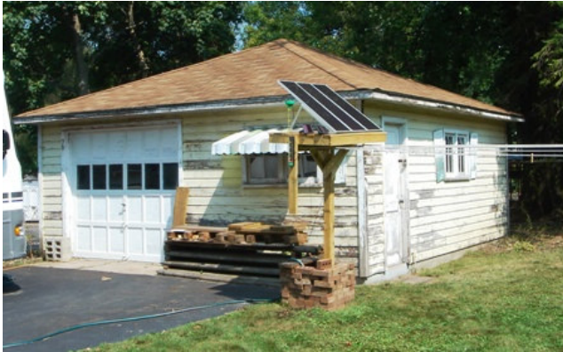
I installed a solar panel and a clothesline in July and saw how bad the garage looked.