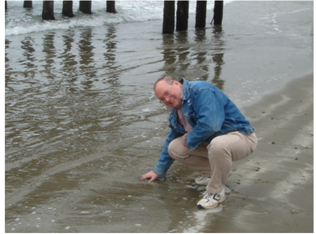
I touched the Pacific Ocean in April