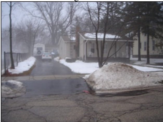
What a difference a day makes.

When I was leaving the house this morning I noticed something looked different. You know I had to email him a picture showing how much better it looked this morning.