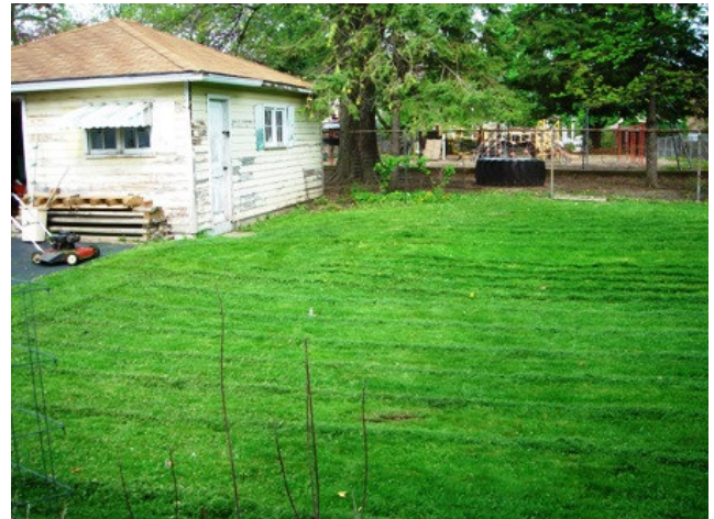
I cut the grass for the 1 st time in 10 years in May