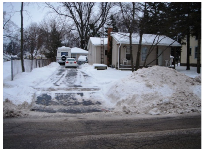
We did get snow in December for Christmas.