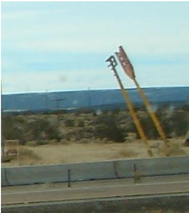
Here is a close up of the arrows.