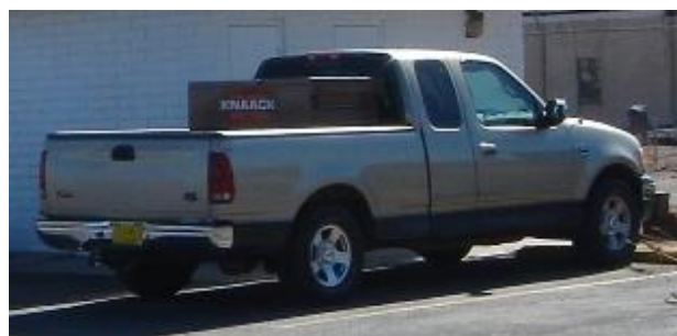
See the close up.