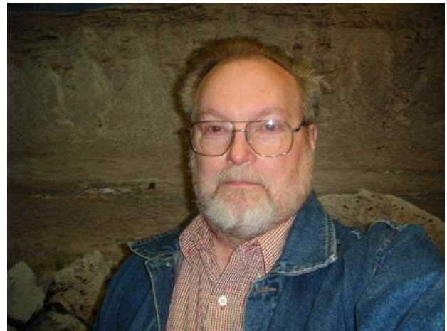
I had to take a picture of myself in front of the picture of the creator in the museum.