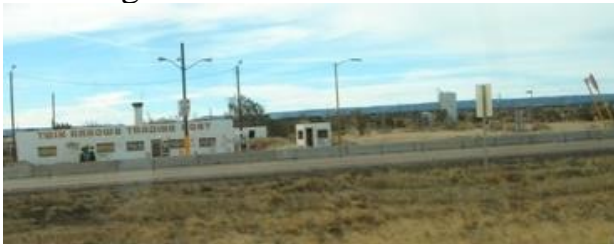
Note the arrows are on the far right.

One of the places I always like to drive by is Twin Arrows, AZ. There is the abandon souvenir shop with 2 great big arrows in the parking lot. It has been closed a long time and the arrows didn't look so good this time.