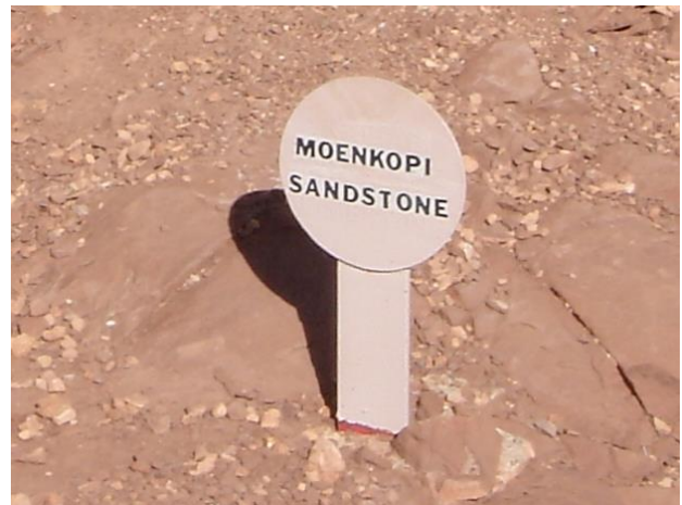
Here is what the sign looks like.

Somewhere I saw this and needed a picture. I thought it was funny they needed a sign to tell me this was a stone. 😊