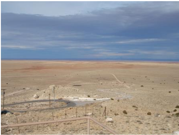
If you look out the other way you could see forever.

Looking in another direction you could see my home was a little lonely.