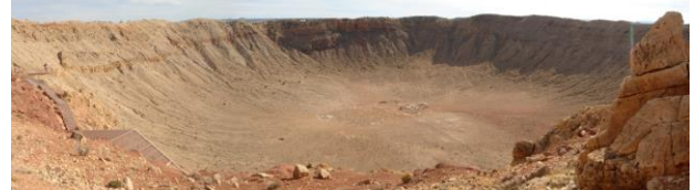
Meteor Creator is very impressive. If you are ever near Winslow, AZ it is a must see place.

The wind was blowing about 50 MPH while we were there so we were holding to our hats.