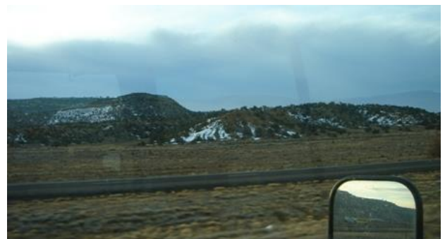
While driving through New Mexico and Arizona I saw they too have some snow.