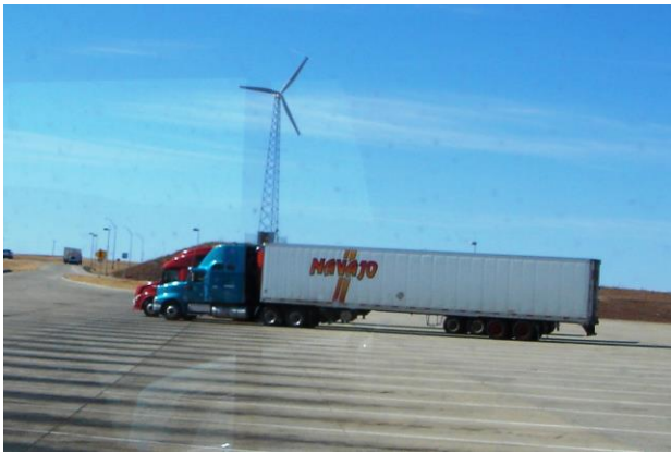
I was seeing a lot of wind turbines. In this one place I even saw one that looked like it was mounted on a truck.