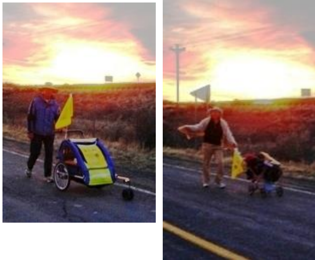
It was very dark when I took these pictures. I am amazed I could get them to show anything.