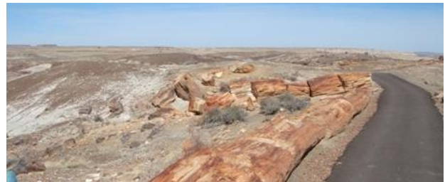
Some of these fallen logs even up close don't look petrified.

We decided to walk in the Petrified Forest.