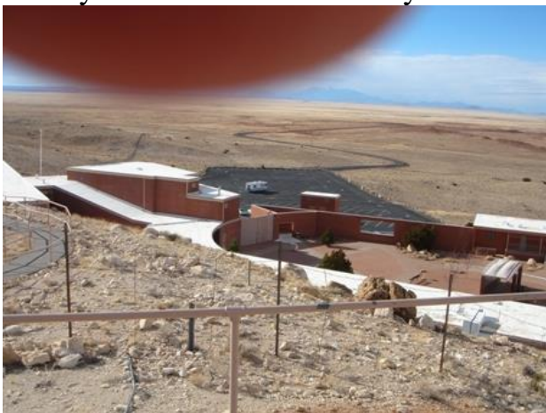
Looking in another direction you could see my home was a little lonely.