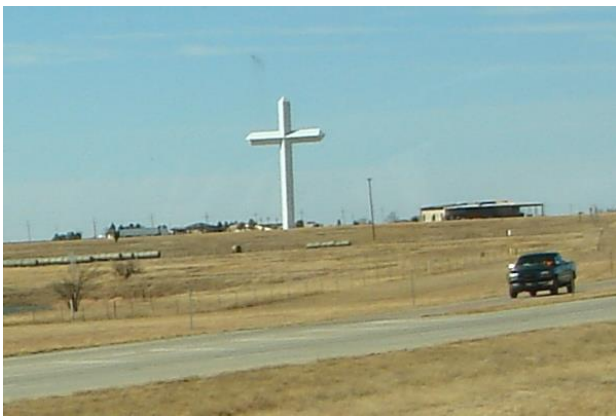
Another thing I saw along the road was these crosses. I think that they were memorials to some that died on the highway. Somewhere along the road was this very big cross? It must have a very important person that died here.

I thought ALCO had gone out of business when they left Woodstock. Well I drove by one and they are still in Business. I shopped in one in New Mexico.