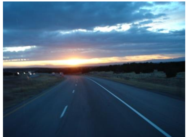
And as before I stayed on the road too long and had to drive into the sunset.