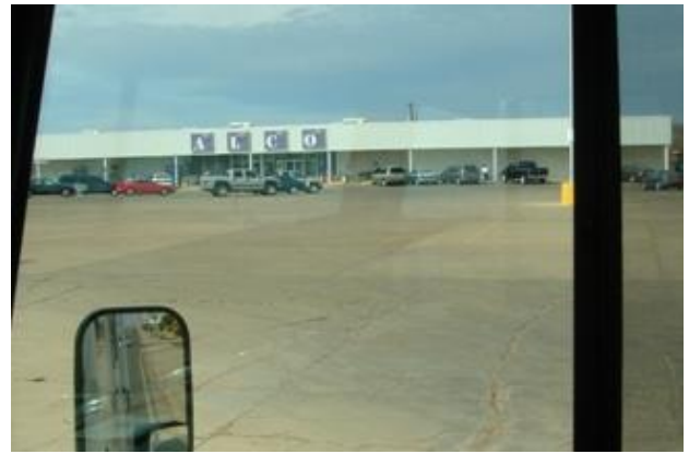
A long time we had a Hornsby store in Woodstock. They went out of business and an ALCO store took it place. These were stores like K-Mart and Wal-Mart before they started to sell food.

I thought ALCO had gone out of business when they left Woodstock. Well I drove by one and they are still in Business. I shopped in one in New Mexico.