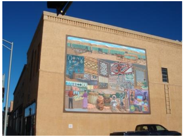
The Graffiti on the wall in New Mexico is sometimes better than back home.