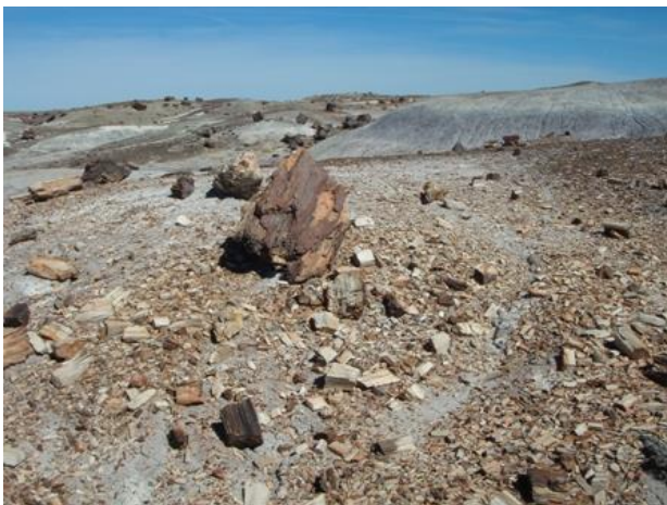
This picture shows up wood chips, well, what looks like wood chips. It is really petrified wood.

Maybe those cave men had stone chippers. ☺ Even up close they look like wood.