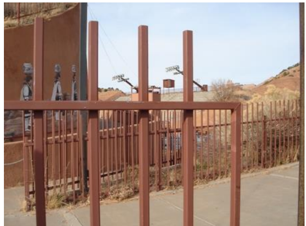
Red Rock State Park was really just Red Rock Park. Now owned by the City and is some kind of Sports Park. You could not get in to it because of all the bars. And yes, it was closed! The RV Park!

This issue and this month are at the end. There is more to my vacation and you can read about in the next issue.