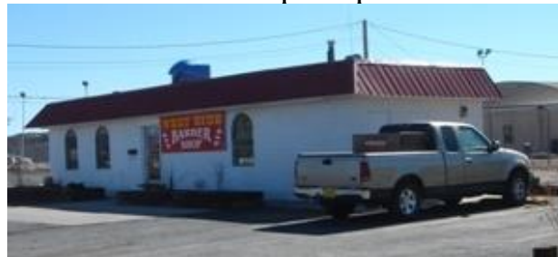
When I arrived at the barber shop I ran in to another old friend sitting in the back of the barber's pickup.