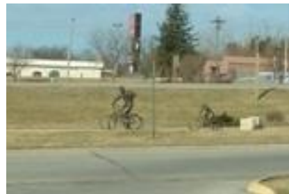
out. I found it! ☺

When you drive into the sunset or in my cast the sunrise you can't see where you are going. You can pull the visor and block the sun but at sunrise you have to pull it down all the way to the dash board. When it is that bad you look for a rest area with a Wi-Fi and wait it