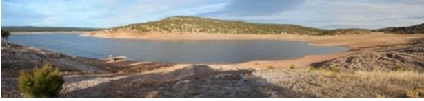
This is the lake at Blue Water State Park.

We stayed at Blue Water State Park last night. We almost had the whole place to ourselves.