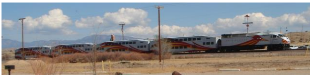
The Rail Runner was a neat train ride.

Anyway I found my train and got a ride back to the RV Park.