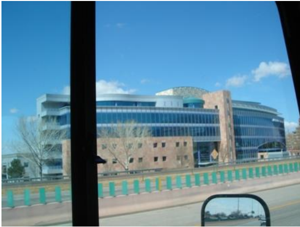
On the way out of Albuquerque I saw this neat building. Since I was driving and taking a picture I didn't its name.

After lunch I will head in the direction of Woodstock. I have enjoyed my journey but I long to return home for a while.