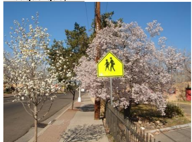
As you can see from this picture spring has come to Albuquerque.

This weekend I am going to the 2009 Gathering of Pilgrims in downtown Albuquerque this weekend maybe I will stay here instead of going to the hotel where it is.