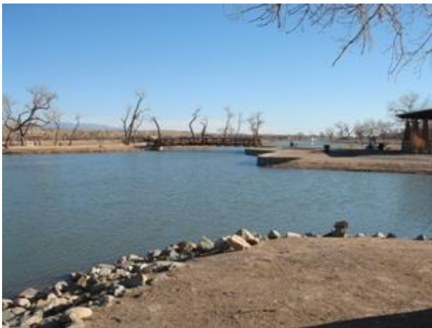
This is a view of the lake at the Isleta RV Park.

I am at the Isleta Lakes and Recreation Area RV Park. It is called "The finest Fishing and Camping Resort within 15 minutes of Albuquerque." And I should go out and enjoy more of it and stop typing. So far I have seen the convince store and the laundry room. It is time to walk around the lake. Maybe now!