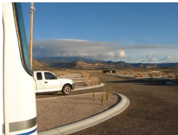
The view of a storm not too far away was a good thing to see. After the storms the winds seem to lighten up.

The Wind is blowing here. They are calling for 50 mph gust today. Mike & Petra are walking with the wind at the back. They will call if it gets too much for them to walk.