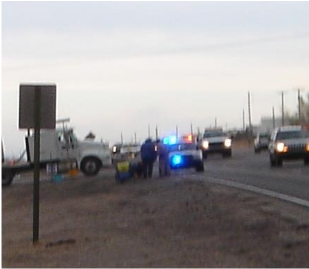
The police pull over walkers too!