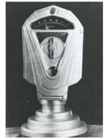
1935 model parking meter

As years passed, criminals found it easy to bust into a meter and steal the coins. So in the 1960s, the machines began sporting armored coin boxes. In 1960, New York City hired its first crew of women "Meter