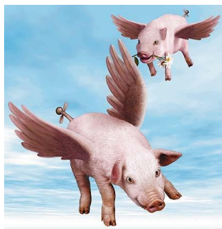
Is this what I should be scared of?