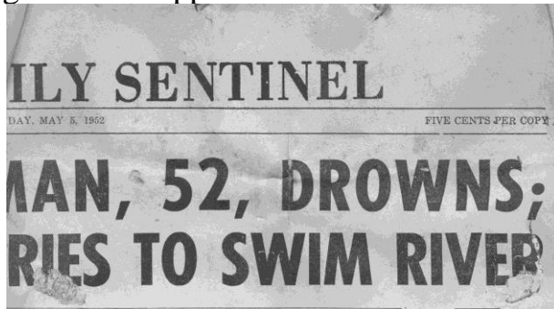
Woodstock Daily Sentinel Headlines May 5, 1952

I copied a quarter of a page but it was too wrinkled to read so I will try to get some snippets.