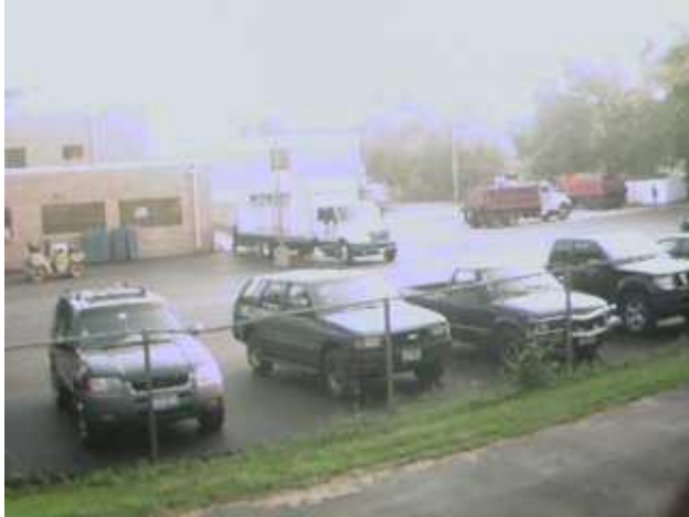
On 08/06 they were parking on yesterday's asphalt at 7:45am

While all of this asphaltting was going on they were many trucks delivering things into the school.