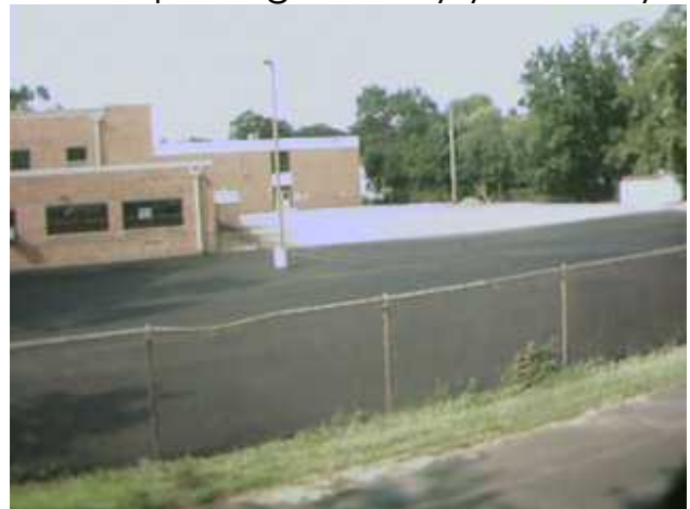
Before they left for the day at 4:20pm half to the base layer was in place