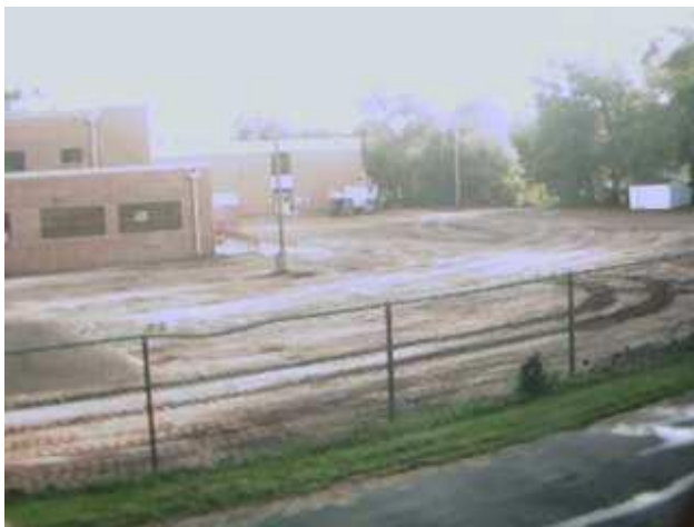
School parking lot 08/05/10 at 9:30am

You see this started as a very muddy mess. It was not ready for that pavers yet the next day. I