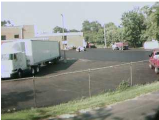
At 5:30pm they had the base complete and half of the finishing layer of the asphalt layed down

While all of this asphaltting was going on they were many trucks delivering things into the school.