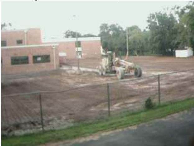
On 08/04 it was still a little muddy and quit messy

It has been a fantastic day today. Even those pavers next door were going head strong putting down that asphalt.