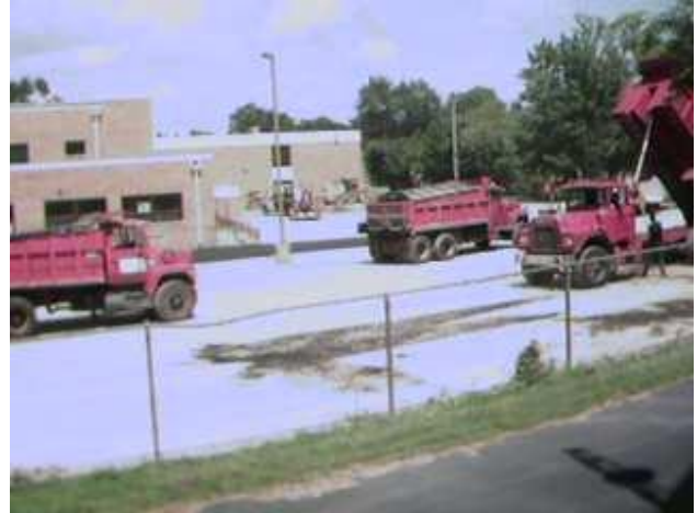
The paving begins around 2:15pm

didn't about taking pictures much before Wednesday.