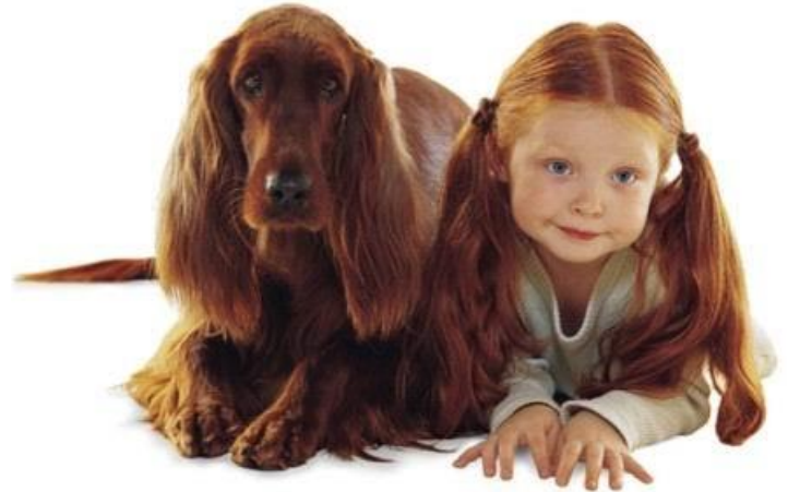
One Dog, One Girl!

Ok there were Some Dog pictures in another Email.