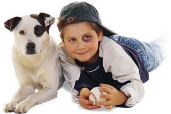
One Dog, One Boy!

Are the people looking more like their pets or the pets trying to look like us? You decide.