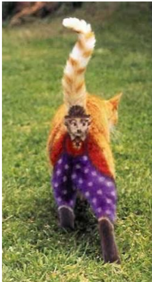
Yes, Cat's Ass!