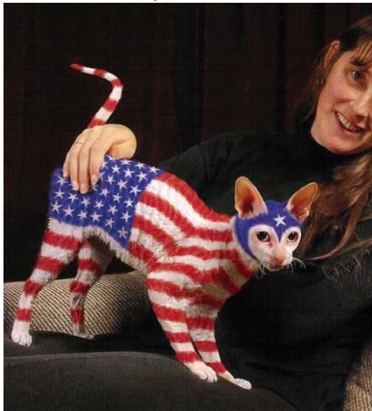
Must be a flag waver.

The Caption in the Email went like this: "The book these came from said some of the paint jobs cost $15,000 and had to be repeated every 3 months as the cat's hair grows out. Must be nice to have $60,000 a year just to keep your Cat painted!"