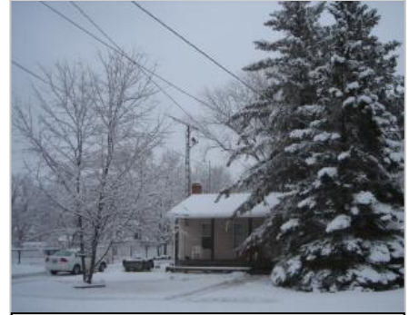
The Snow Looks Nice

http://www.martysthoughts.info/randomthoughts/pdf/20080101/PublicAct095-0017.pdf