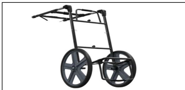
HipStar team, Included Items, Harness & Hand break