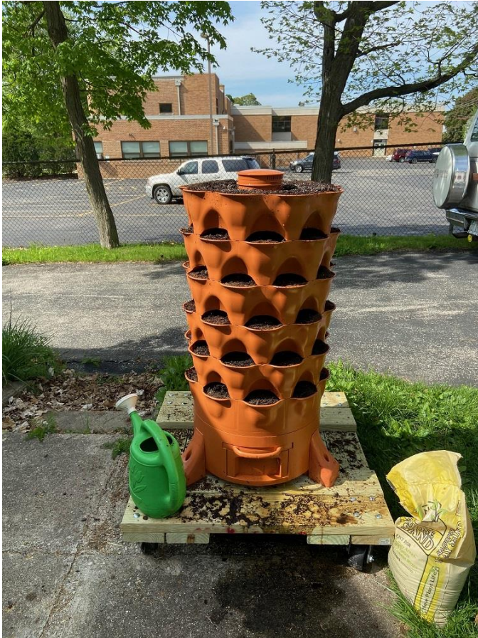
Figure 1 Garden Tower Project, day 1