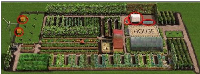
18-May-23 9:00 am @EWT 54° F

This is my next garden. Not so much grass to cut!